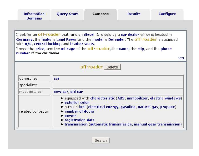
Figure 3: Query example in the new QI, with focus set on the concept "off-roader".

a generalization, a specialization, or add a compatible concept. Related concepts can be chosen: here, in order to reduce the quantity of information shown to the user, the name of attributes (usually has ...) are hidden and only the range concepts are visible (e.g. exterior color, number of doors, power ...). On the contrary, relations between concepts are shown ( equipped with ..., runs on...).