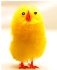
Figure 1: Aww....

\documentclass{article} \usepackage{graphicx} \begin{document} Figure \ref{fig:chick} shows \ldots \begin{figure} \centering \includegraphics[% width=0.5\textwidth]{big_chick} \caption{\label{fig:chick}Aww\ldots.} \end{figure} \end{document}