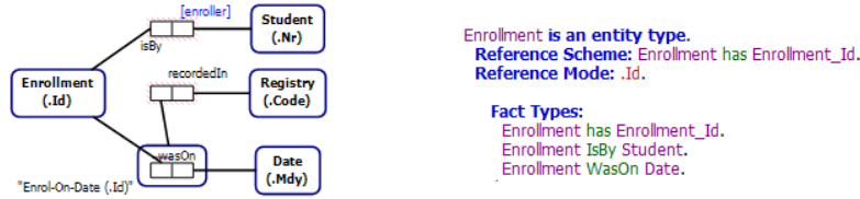
Fig. 1. Example of an ORM2 schema, together with the fragment of its verbalisation.