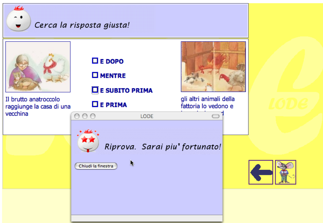
Figure 7.2: A comprehension exercise with the textual representation.