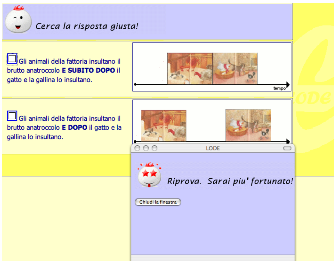
Figure 7.3: A comprehension exercise with the graphical representation.