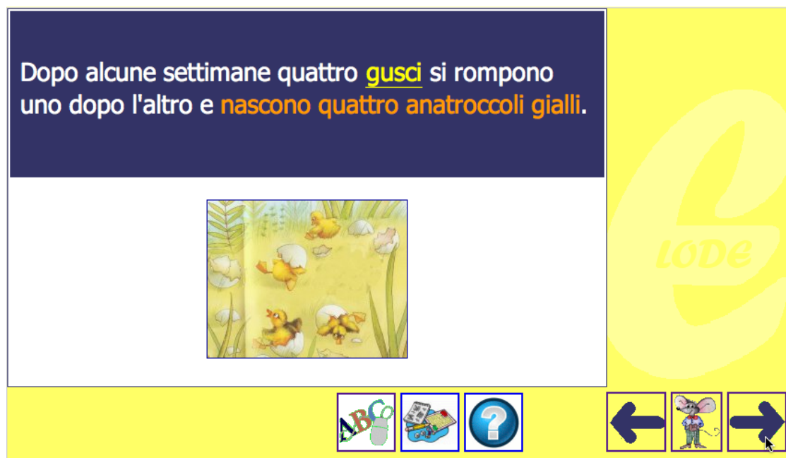
Figure 7.1: LODE: a screen-shot of a client session: at the top, the first page of LODE; at the bottom, a story page.