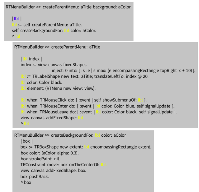
Fig. 2. Visual cues in the Pitekün. When a user hovers over the each part of source code, relevant information is highlighted among the displayed codebase. This figure illustrates highlighted variable “lbl”. If a developer wants to know how a given object is manipulated, this visualization helps him/her concentrate on a particular pieces of the code.

hovers above the variable and all the other occurrences are highlighted. This visual cue facilitates navigation in the code.