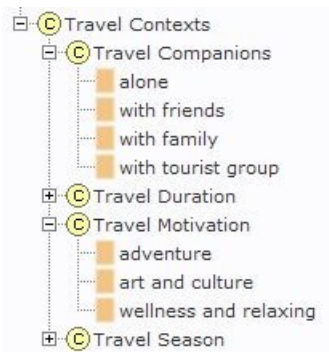
Figure 2: Context Representation in GUMO