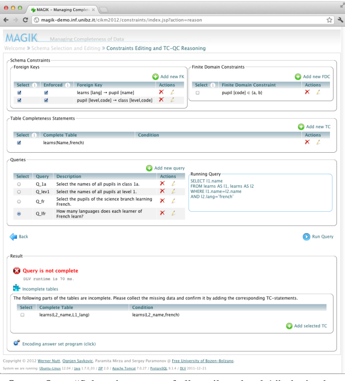
Figure 1: Screenshot of the MAGIK demonstrator

The atom pupil (P_name, 1, a), where P_name is a variable and 1, a are constants, represents all records satisfying the selection \sigma_{level=1,code=a} (pupil). We see that, unsurprisingly, MAGIK suggests the statement TC_{1a} from above, or, in words, it proposes to complete the pupils of class 1a.