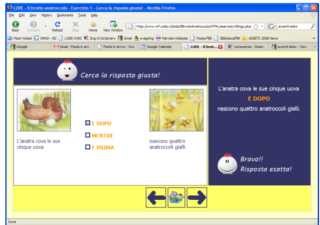
Figure 1: LODE: a screen-shot of the CTx game with a positive feedback.

LODE narrates simplified versions of traditional children's stories, such as The Ugly Duckling , so that the language is more suitable to novice readers, and deaf children in particular. A story is divided into web pages as a storybook for young children. A demonstrator of the tool is made available online (lodedemo 2009). All the reasoning games of LODE use the LODE relations—see the introductory section. According to (Schaecken, V. der Henst, and Schroyens 2006), and in line with cognitive economy, people are often better with deductive tasks that admit solutions (a.k.a., models), and are happy with one plausible solution. The reasoning games of LODE are built on such findings, e.g., the games