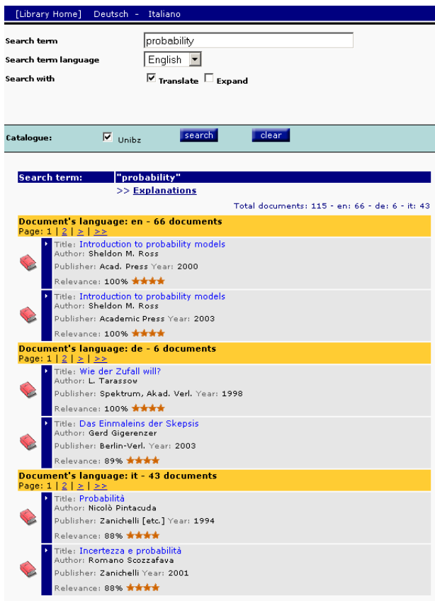
Figure 3: MUSiL user interface: output