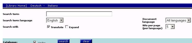
Figure 2: MUSIL user interface: functionalities

The retrieved documents are clustered per language and ranked on the base of their relevance, as shown in Figure 3. When the Translate and/or Expand modes are activated, the system shows all the terms used for the search. For instance, for the English query term "probability" by clicking on "Explanations" the users will be given the following translated terms: Wahrscheinlichkeit (German), probabilità, simile, verosimiglianza, accidentalità, casualità (Italian) (see Figure 3.)