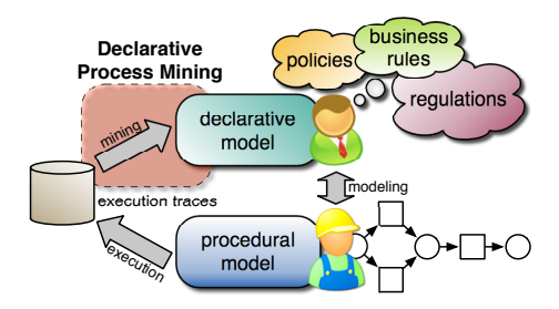
Fig. 1. Declarative and procedural perspectives when modeling Business Processes

model will typically involve business rules, covering best practices and internal constraints as well as internal/external regulations and compliance requirements.