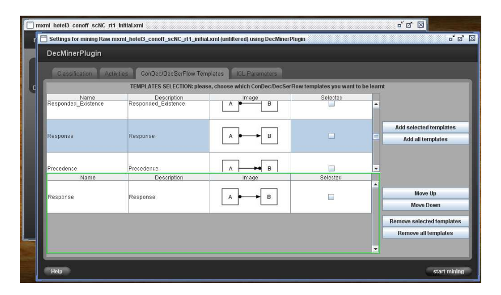
Fig. 4. DecMiner plug-in: ConDec template selection

DecMiner has been then applied to each training dataset. By applying the learned models to the classification of the testing sets, we computed the classification accuracy , defined as the number of compliant traces that are correctly classified as compliant plus the number of non-compliant traces that are correctly classified as non-compliant divided by the total number of traces. The average accuracy achieved by DecMiner was 100%.